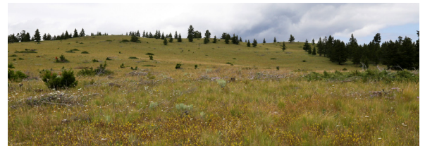
Post-treatment High Lake area