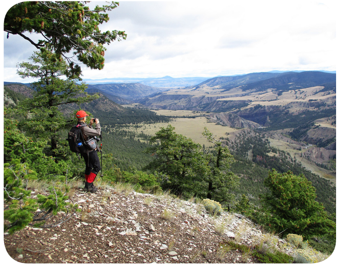
Churn Creek canyon from Cougar Pt

Sheep Flats/Goose Lks. On September 23rd, we planned to hike to Sheep Flats on the north side of Churn Creek. However recent rains made the vehicle trail through the grasslands above the Flats very slick. To avoid damaging the grasslands, we parked the vehicle at the north end of Goose Lakes, leaving insufficient time to reach Sheep Flats. However, we explored the very pleasant and rich landscapes of the Goose Lakes area. This area has a great diversity of ecosystems including various grasslands, aspen stands, wetlands, and open old-growth Douglas-fir forests with many fire scars. We identified many birds and enjoyed great views of the upper Churn Creek Valley from our lunch spot at Cougar Point.