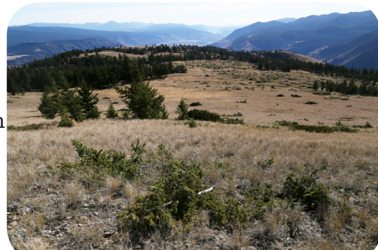
High Lake area and Fraser Valley

High Lake Benchmark Grassland. On June 24th, a small group hiked to High Lake from the gate at the entrance to the protected area near the end of the Perlite Road. High Lake is a benchmark (ecological reference area) grassland within CCPA and the site of our recent grassland restoration efforts. It provides great views of the southern part of the Protected Area. The trail passed through an impressive open stand of old growth Douglas-fir and past several small wetlands. After viewing the restoration treatments, we had lunch on the ridge above High Lake which offered outstanding views both up and down the Fraser River Valley.