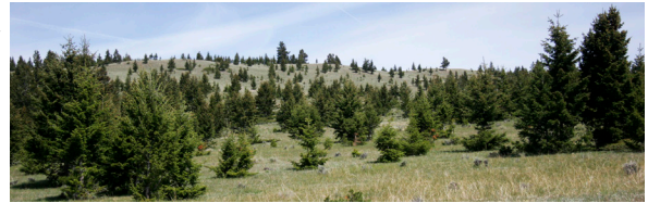
Pre-treatment High Lake area

Tree Encroachment Clearing: FCC volunteers secured funding and volunteered hundreds of hours to restore open grasslands in CCPA by removing tree encroachment, which is resulting in widespread loss of grasslands. The principal focus has been on restoration of ecological reference area grasslands near High Lake, where nearly 130 ha of high elevation grassland was restored. Other areas recently included for treatments are on Airport Flats and Sheep Flats, adding another 300 ha of restored grassland. At High Lake, treatments included cutting, bucking, piling, and burning of young trees. Thank you to all of our funding partners.