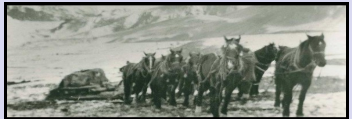
An 8 horse hitch used to drag a stone bolt with petroglyph from Fraser River to railhead north of Clinton