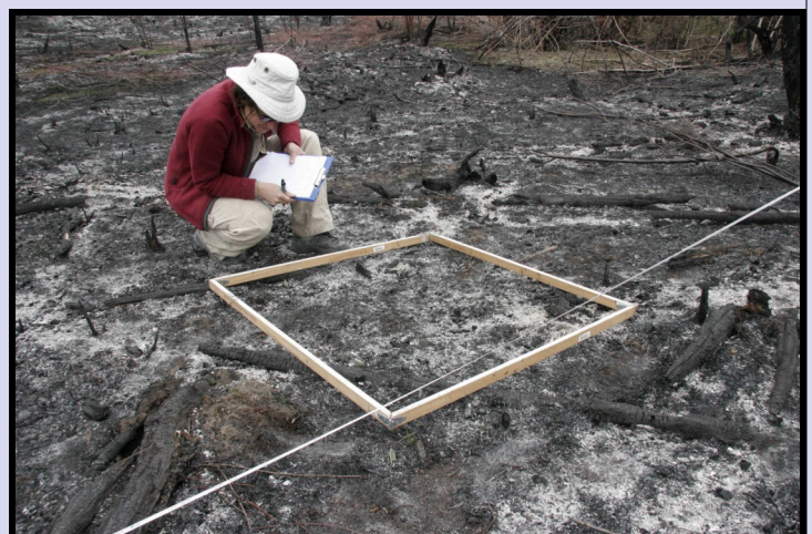
Kristi measuring post-burn vegetation plots near Onion Lakes