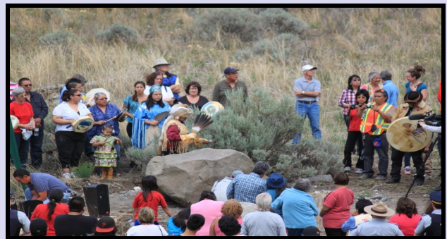
Welcome home ceremony at Churn Creek June 13, 2012

horses a month to drag the boulder from the sandbar along the Fraser up the 3,000 foot ascent to the railhead near Clinton. After years of being in Stanley Park in an unsheltered area where it was subject to vandalism, the Park Board and the Museum agreed to donate and move the rock to Museum of Vancouver. After consultation with its people about where the petroglyph should rest after its return, the Stswe cem'c Xgat'tem First Nation has decided to place the petroglyph in Churn Creek Protected Area upon its return on June 13, 2012.