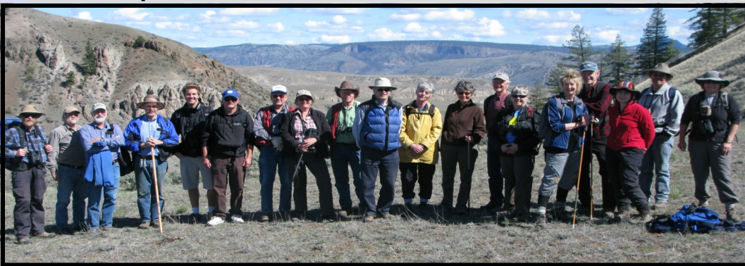
Attendees at the 2010 AGM and hike to Churn Creek Protected Area