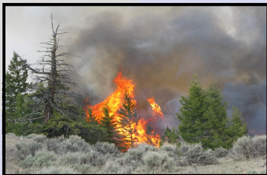
Spring burn at Onion Lakes

tablished in 2012 in order to measure burn effects and determine if burn objectives were met. A report of first year vegetation effects was submitted to BC Parks and is available at www.friendsofchurn.ca